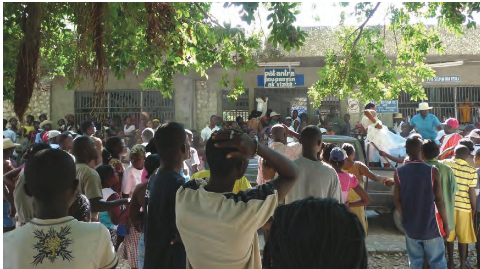
Anxious families wait outside the hospital for news of their loved ones inside.

Six Lunch Buffets or Six Dinner Entrees One coupon per table Not valid with any other Offer or on holidays.