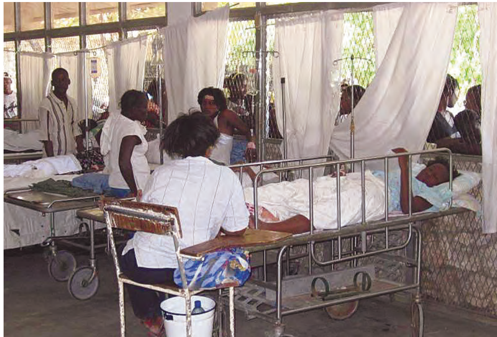
A medical ward at Hôpital Albert Schweitzer Haiti.